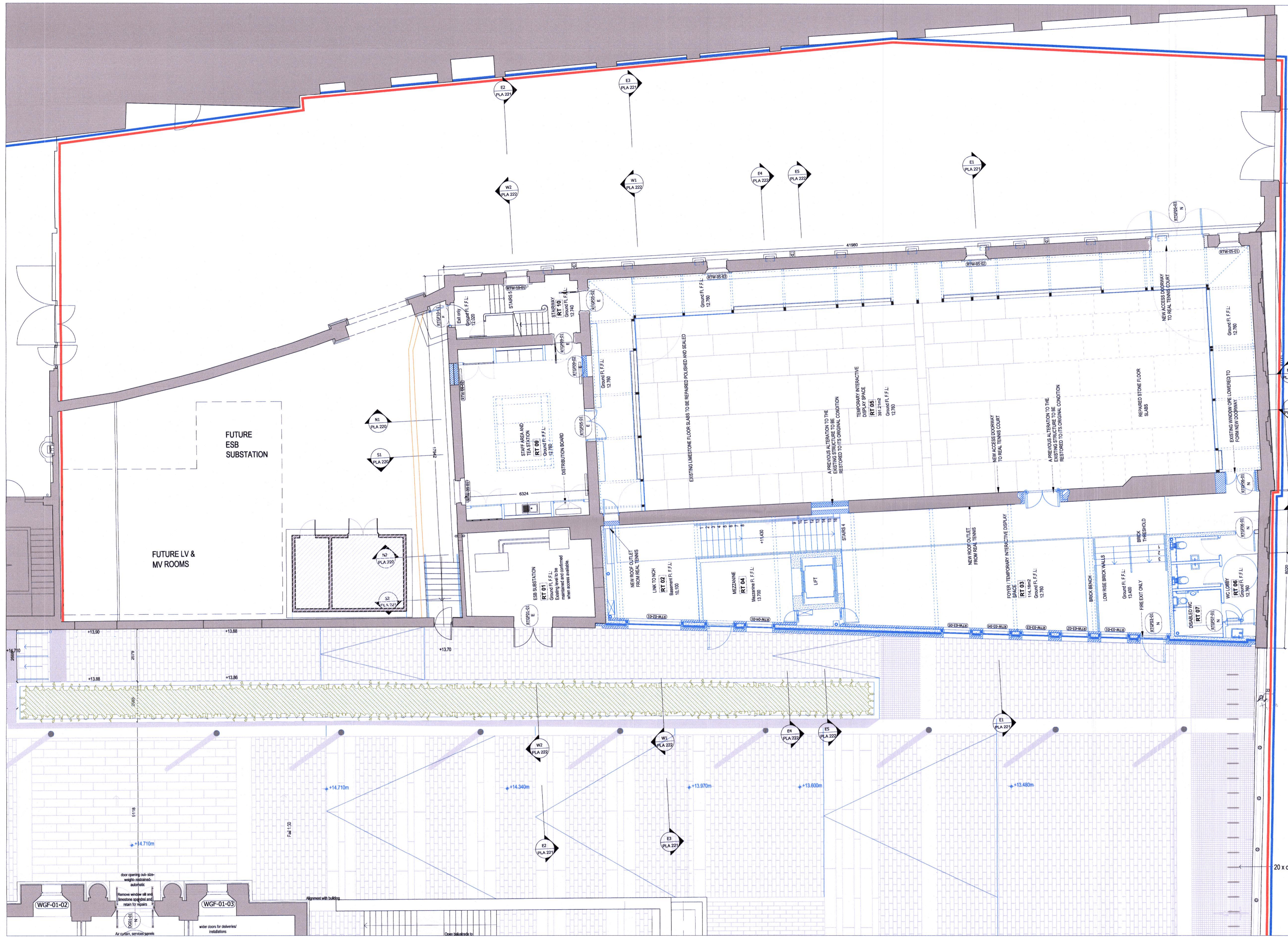
PROPOSED REAL TENNIS COURT GROUND FLOOR PLAN